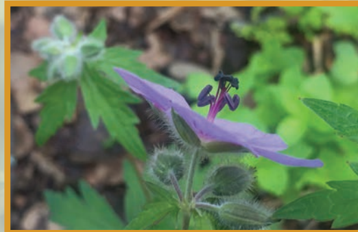
Patty Sullivan, MSB

The hiking trail around X Lake is 3.25 miles. In all, eight miles of trails let you take in the richness of the woods. Loons call on the lake. Beavers, foxes, bears, and moose are native. In spring, delicate roses, fiddleheads, and columbine unfold.